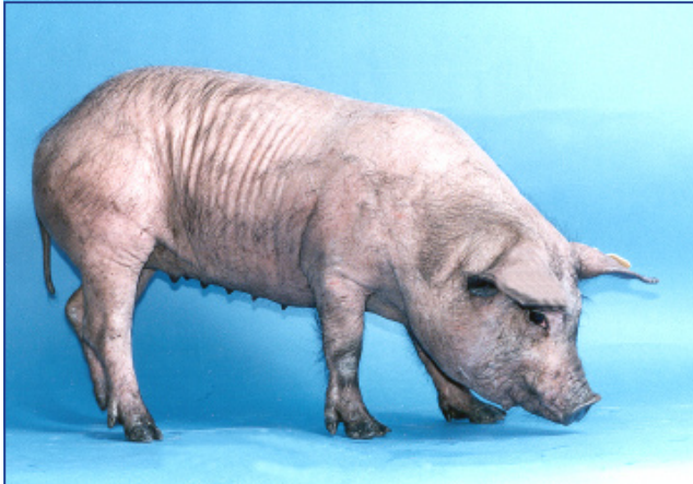
Micro-Yucatan Miniature Swine